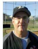
X-TRA INNINGS BASEBALL Golden Mile Industrial Court 3247A Old Frankstown Road Pittsburgh, PA 15239 (724) 733-4893 xtrainings15@yahoo.com